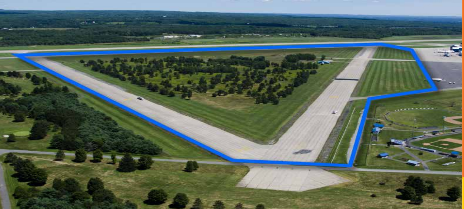
Aviation Gateway viewing East

The Aviation Gateway parcels at Griffiss International Airport feature an on-site airport with 11,820 ft. runway and state-of-the-art support facilities that make this nationally recognized research hub an ideal location for aviation based projects. Located adjacent to runway, these undeveloped parcels have flexible orientation, immediate taxiway access and are easily subdivided to suit development needs.