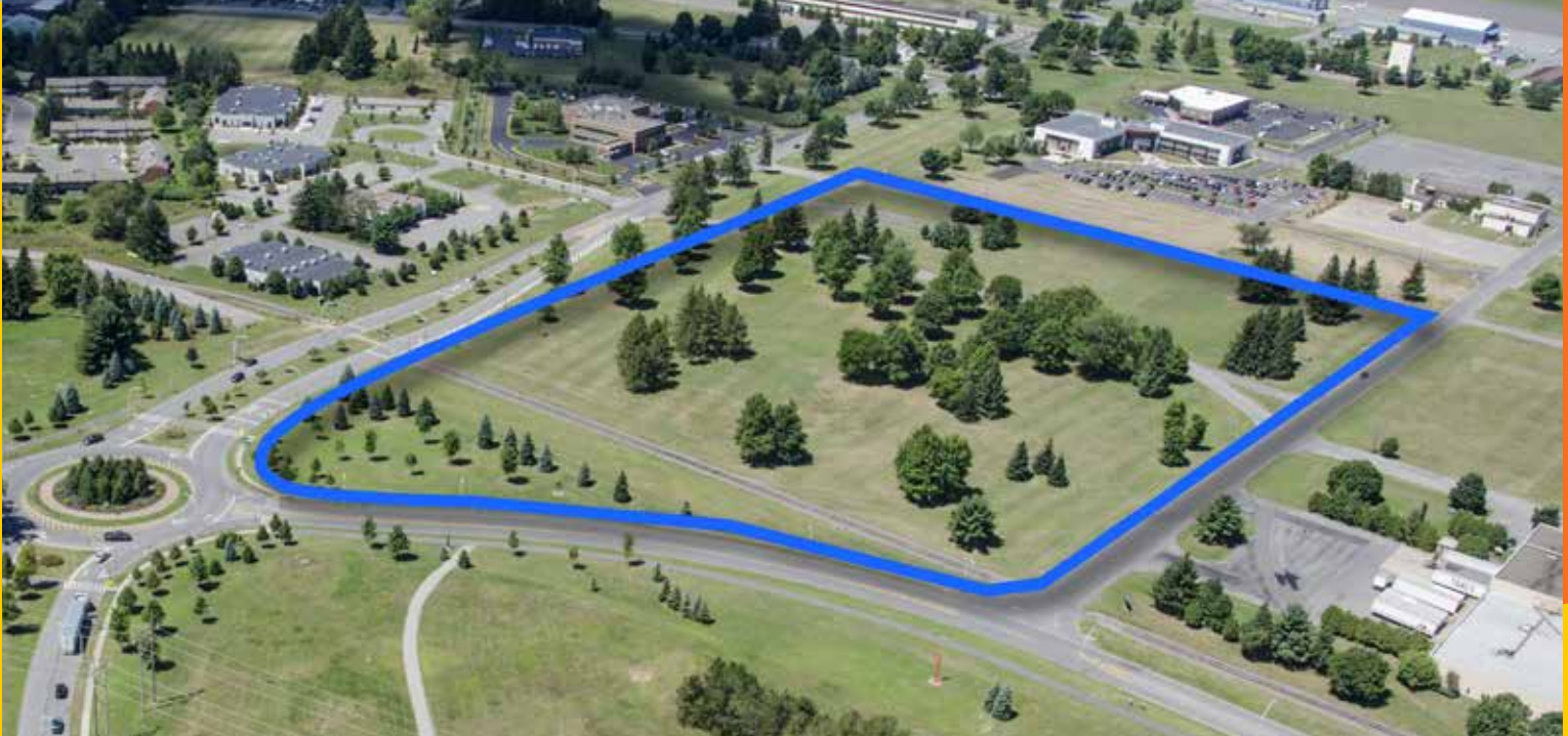
Park Center: Ellsworth Road & March Street viewing North

Park Center is the “Downtown” of the Griffiss Business and Technology Park. The Air Force Research Laboratory, Defense Finance & Accounting Service and growing private sector companies like Assured Information Security create a dense population of employees making Park Center prime for new development.